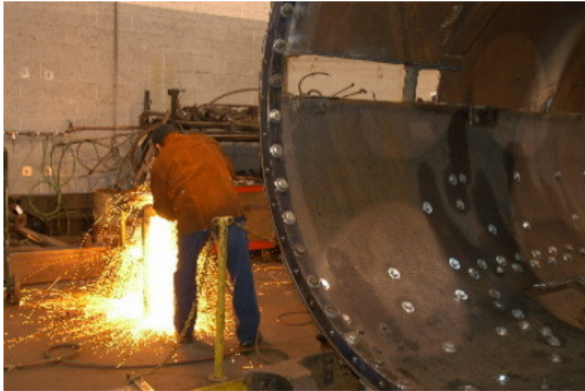
Bruce Mowbray cutting shims for 3713.

In the first few months of 2004 work on the 3713 has continued. While parts are being disassembled, some new parts are being fabricated and are prepared for installation. More information is coming on this.