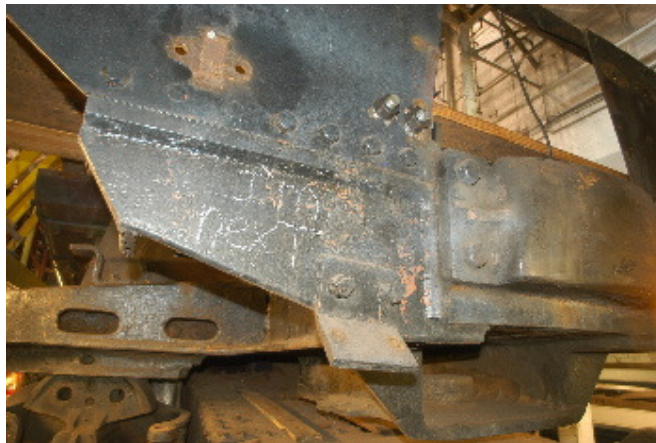
Another view of the 3713