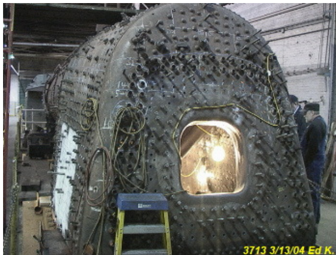
Veiw of locomotive showing staybolts