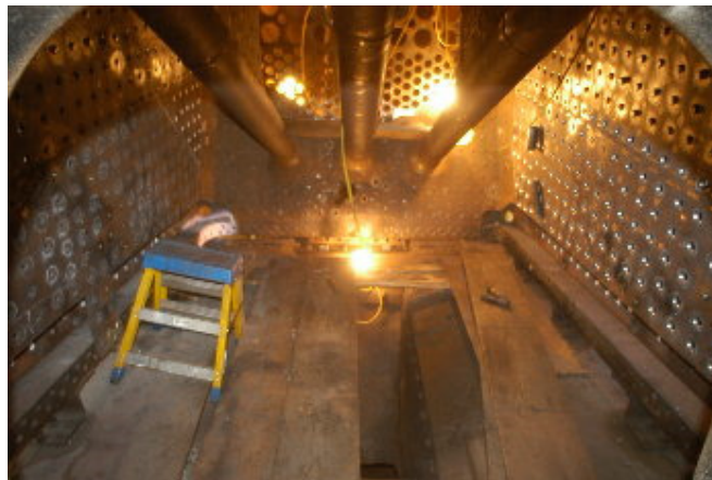
Inside the Firebox