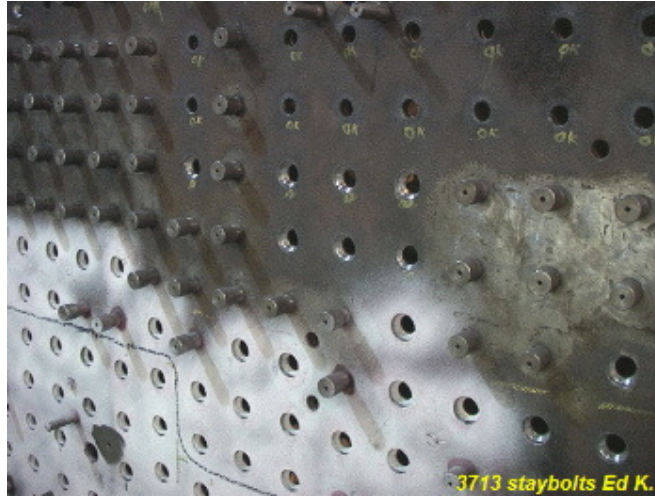
This view shows staybolts being replaced